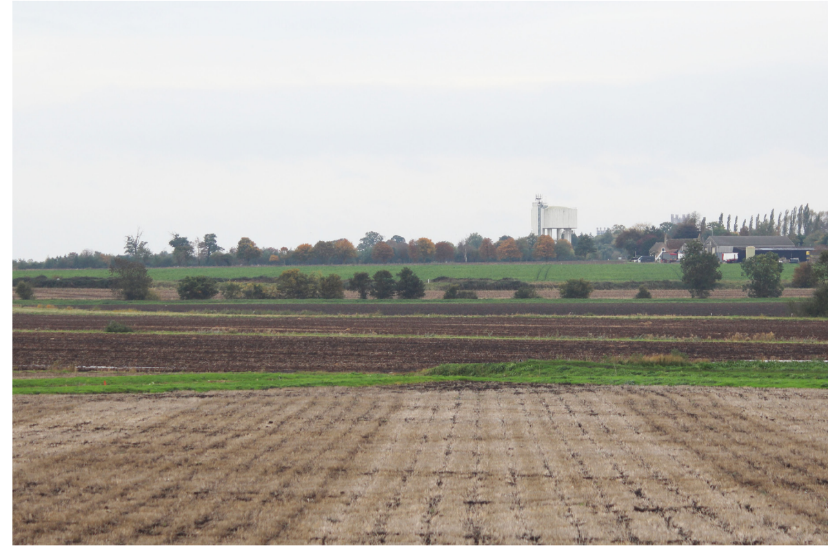
VIEW FROM KETTLESWORTH DROVE existing