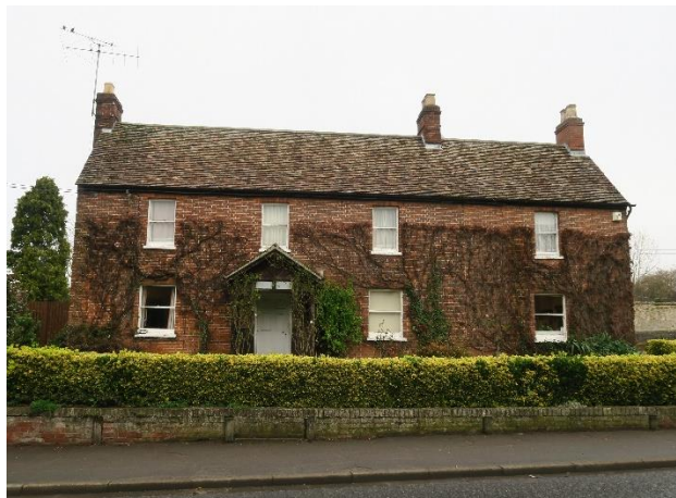
FLIB10 – Seeley House, 32 Church Street