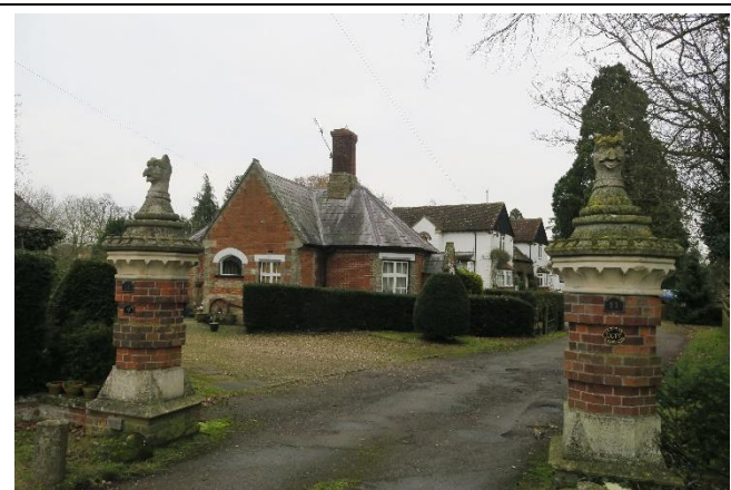
FLIB13 – The Old Lodge, 9 Newmarket Road