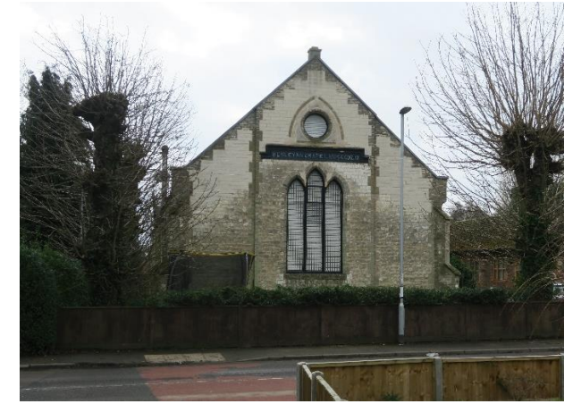
FLIB03 – The former Wesleyan Chapel, Sharmans Road