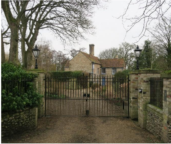
FLIB07 – 4 Mill Lane