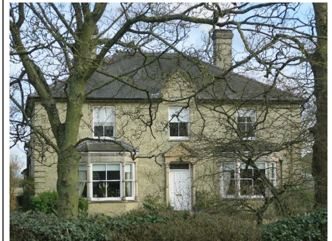
FLIB12 – Trinity Hall, Collin's Hill