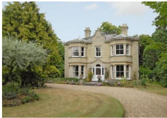
FLIB04 – 46 Market Street, formerly known as Shrublands House