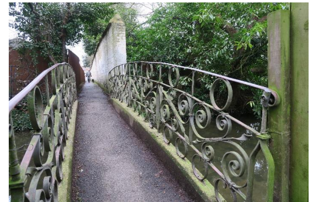
FLIB06 – The Ironbridge, Ironbridge Path