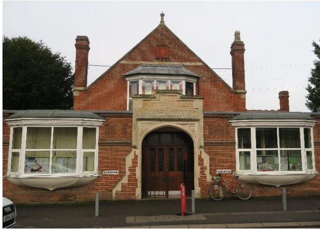
FLIB08 – Victoria Hall, Carter Street