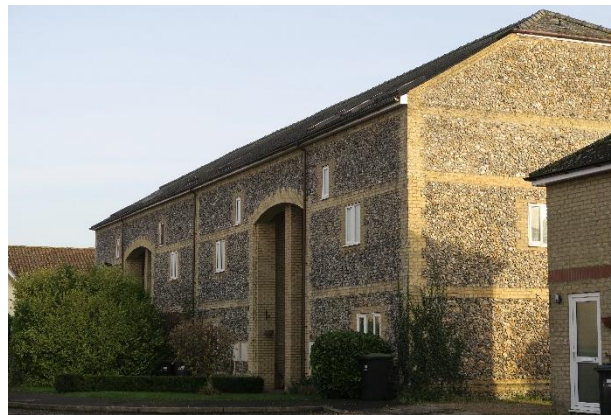
FLIB05 – 12-18 Grove Park