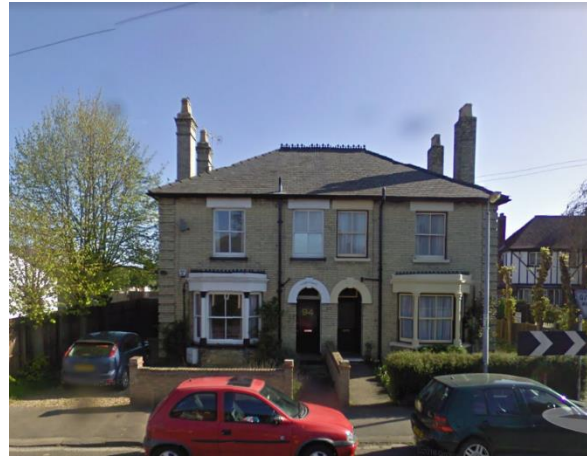
FLIB02 – Pelham House and Ashleydale, nos 92 and 94 Carter Street