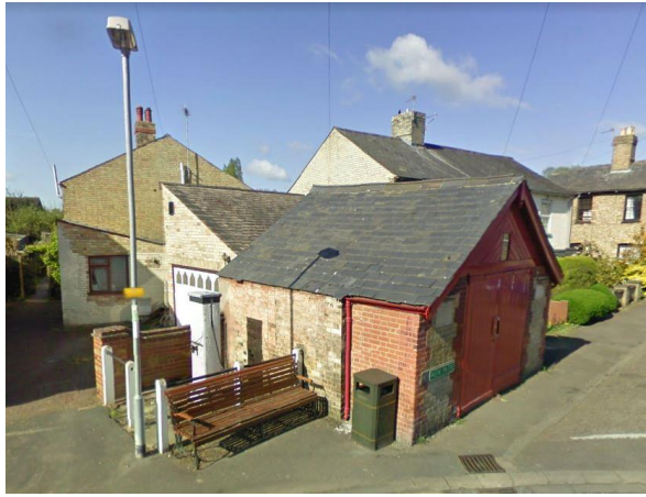
FLIB01 – Fire Station and Pump, Carter Street