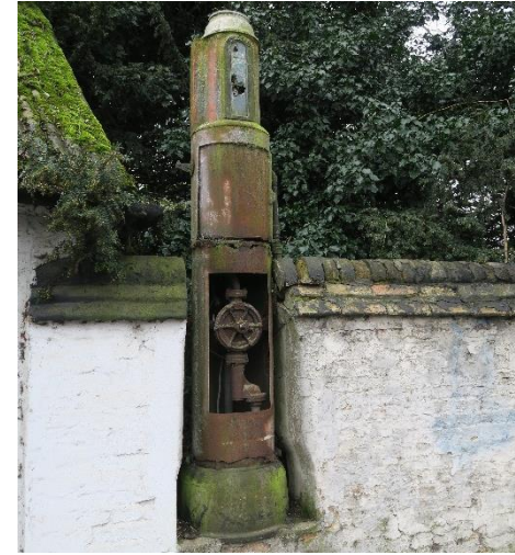
FLIB09 – Pump on the south side of Carter Street