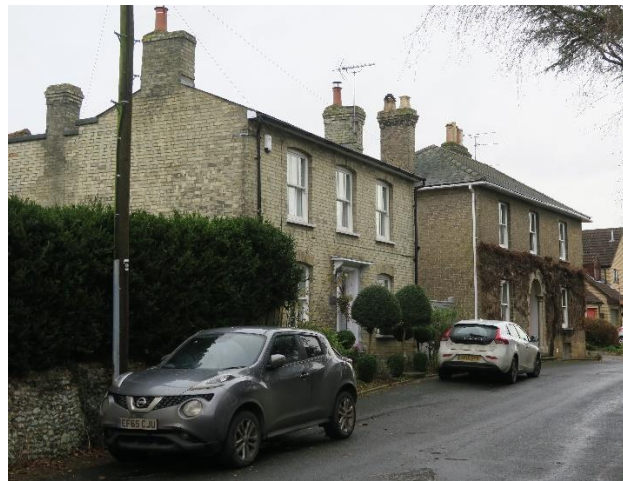
FLIB11 – 83 and 85 Mill Lane